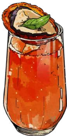
Parmigiana x Bloody Mary 茄子通心粉 x 血腥玛丽

Absolut Vodka, The SG Shochu KOMÉ, eggplant, tomato, Parmigiano Reggiano, basil 绝对伏特加, 爱侍基大米烧酒, 茄子, 番茄, 帕米加诺 - 雷加诺, 罗勒叶