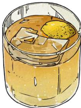
Carbonara x Negroni 卡邦尼意面 x 尼格罗尼

Beefeater Gin, vermouth, campari, Pecorino Romano, peppercorn, guanciale 必富达金酒, 红味美思, 金巴利, 佩克利诺·罗马羊奶酪, 花椒, 风干猪面颊肉