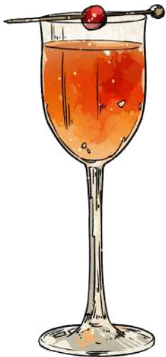
Xiao Long Bao x Manhattan 小笼包 x 罗布·罗伊

Naked Malt, vermouth, The SG Shoshu MUGI, bitters, consommé, XLB sauce 裸雀混合麦芽威士忌，味美思， 爱侍基大麦烧酒，“清汤”，姜醋